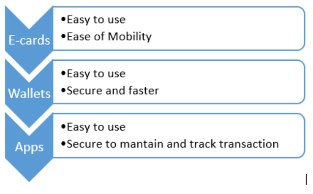
Figure 1: E-Wallet Advantages & Disadvantages

By utilizing block chain technology, users can now make financial transactions with greater speed, security, and privacy than ever before [2]. DeFi also allows users to take advantage of yield farming and other decentralized finance protocols that offer potential rewards. E-wallets powered by gamification and DeFi technologies offer an entirely new way of managing money and making payments. This "E wallet 2.0" not only offers convenience, but also allows users to earn rewards and enjoy an engaging experience when using their digital wallets. This combination of features is helping to revolutionize the way people interact with their finances and could be a major factor in further digitizing the global economy.