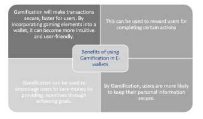
Figure 2: Benefits of Using Gamification in E-Wallets

Finally, by gamifying an e-wallet, users will be more likely to keep their personal information secure. A wallet with gaming elements will typically require users to input secure passwords or other credentials before accessing their funds, which can protect them from potential cyber threat [5] .